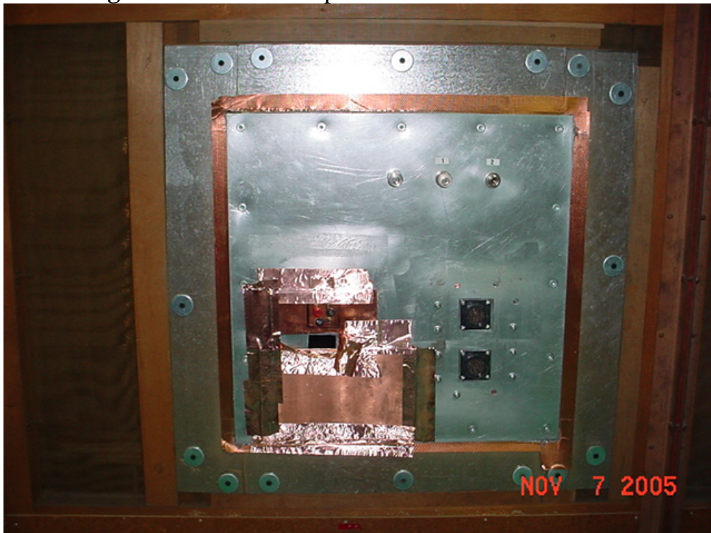
Figure - 5: Room 17F plate from outside the chamber