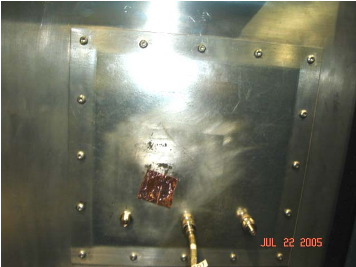
Figure - 3: Room 26A (Test Room) Outer Mounting Plate (View from outside chamber)